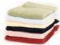
Towels to dry the foot