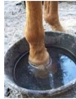
Bucket to soak foot in